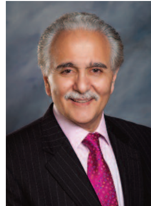
Dr. Joe Massad International Lecturer

Available in 3 sizes. Each refill kit contains 24 dental shells: 6 of each mold (A, B, C and D) Small (part number DS-SM4) Medium (part number DS-MD4) Large (part number DS-LG4)